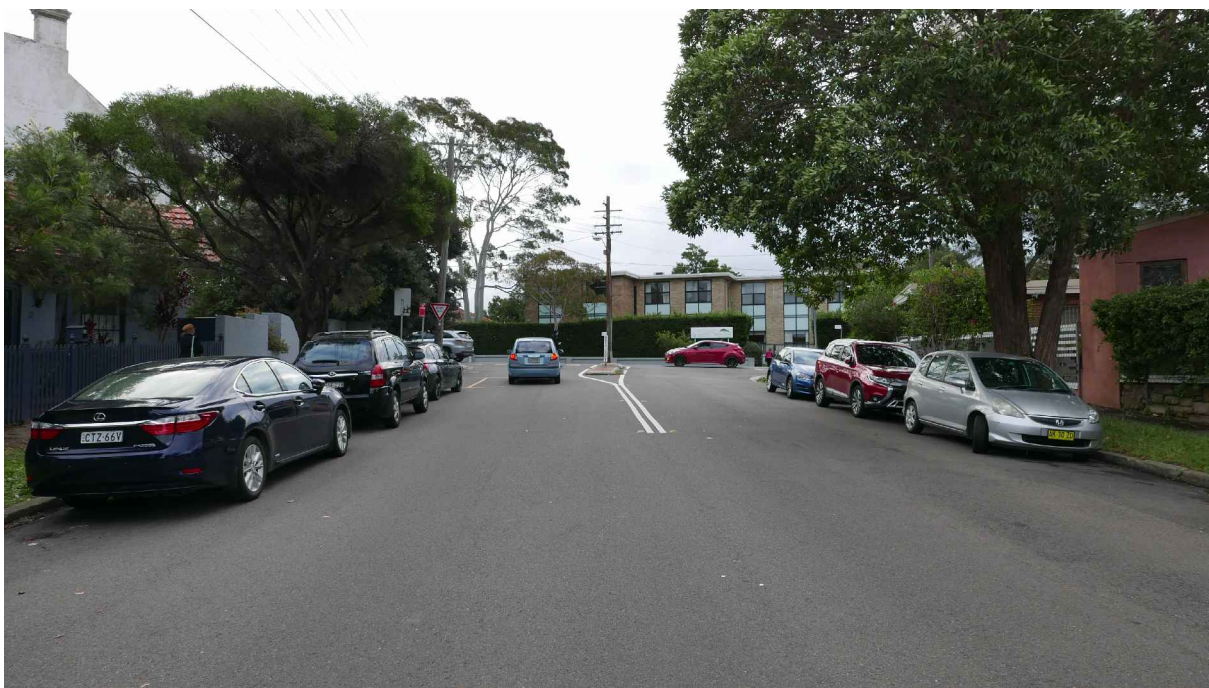
04 View from Chapel Street Existing