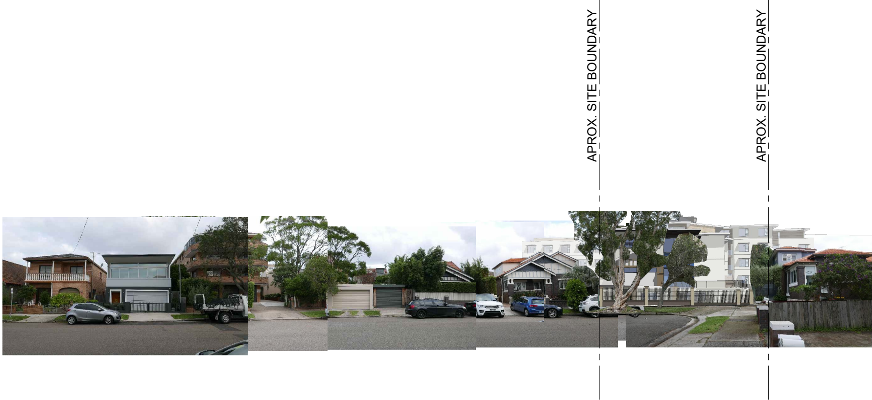
01 McLennan Avenue Street Elevation Proposed