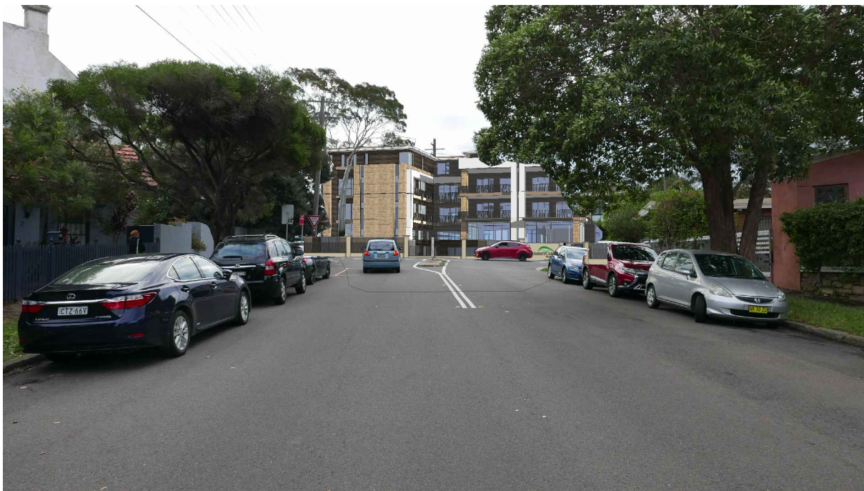
03 View from Chapel Street Proposed