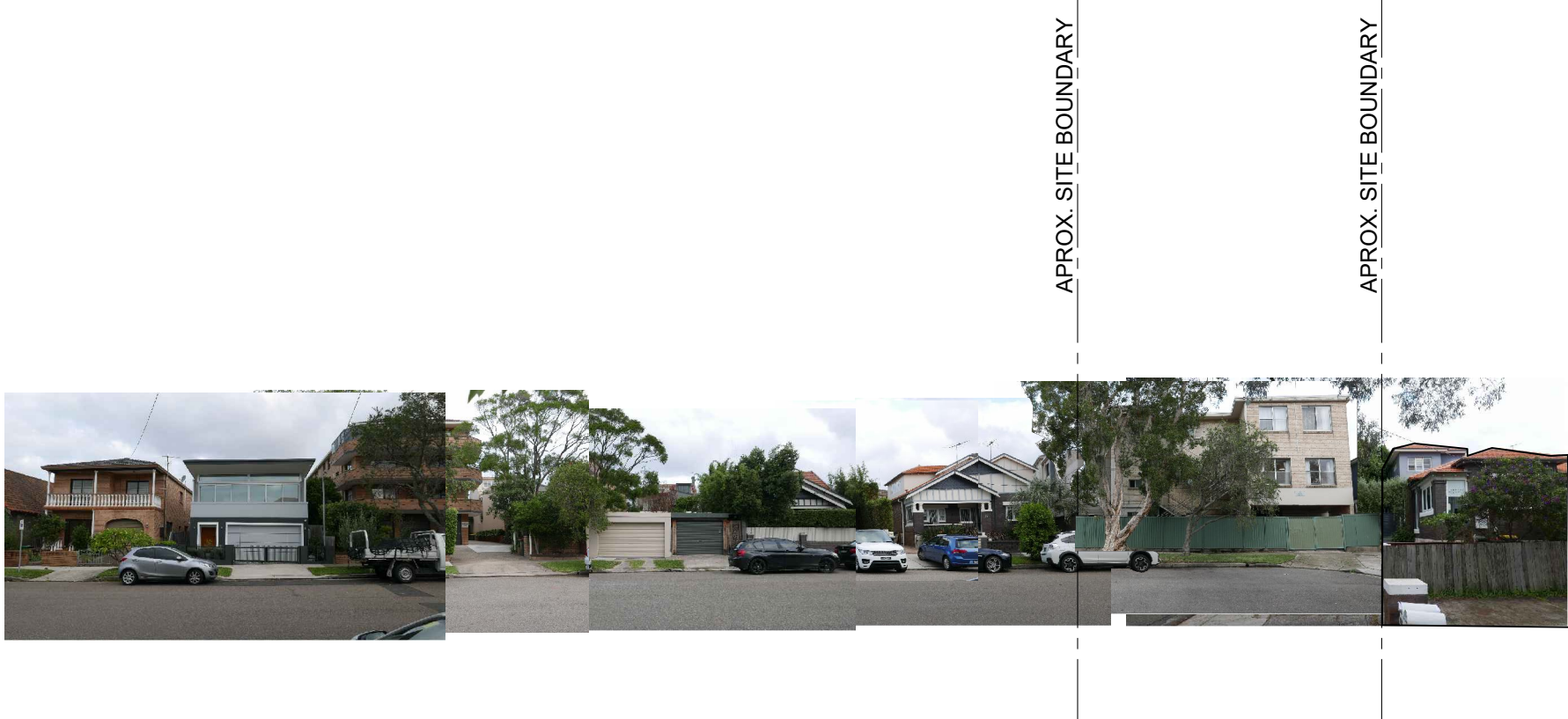
02 McLennan Avenue Street Elevation Existing